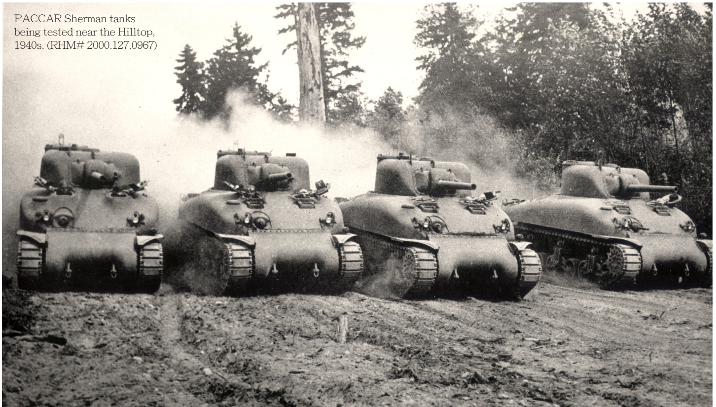
PACCAR Sherman tanks being tested near the Hilltop, 1940s. (RHM# 2000.127.0967)

over? What were the children's experiences in Honeydew and other schools? What kinds of businesses did the residents of the Hilltop start? We look forward to continuing this research, with the help of those who live there!