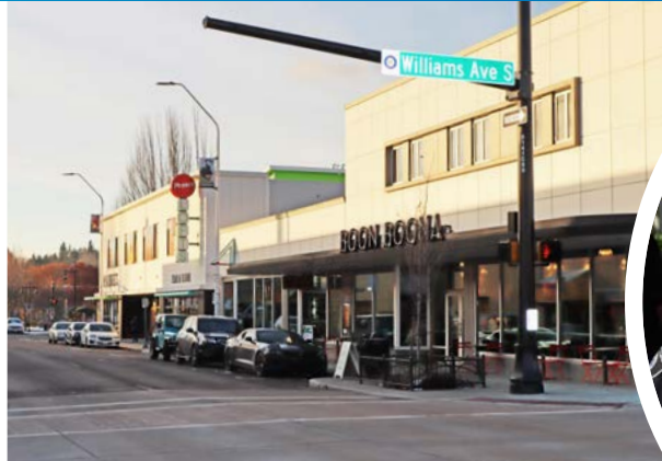
Downtown earned Main Street designation