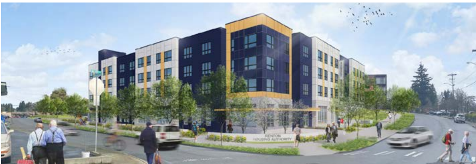
Rendering of Sunset Gardens, a 77-unit affordable housing development in Sunset Neighborhood