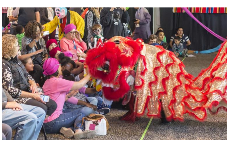
Renton's annual Multicultural Festival celebrates the vast diversity of our city. The Black History Month activities will celebrate and honor our Black history and encourage discussions on diversity, equity, and inclusion both in and out of the workplace.