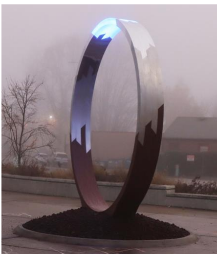
The Renton Loop at the corner of Second and Main.

All these projects were commissioned and supported by the members of the Renton Municipal Arts Commission , which also issued 26 grants last year. The commission's dedicated work is invaluable to the development of public art in our city.