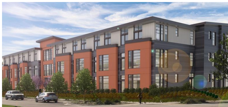
Sunset Oak Apartments are one of four major projects now underway in the Sunset Neighborhood.

Google Translation is available on the website. For additional translation services, contact communications@rentonwa.gov .