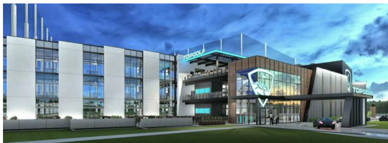
Ground will soon be broken on a Top Golf facility at The Landing.

One of the largest is the 200 Mill project on the site of the former city hall.