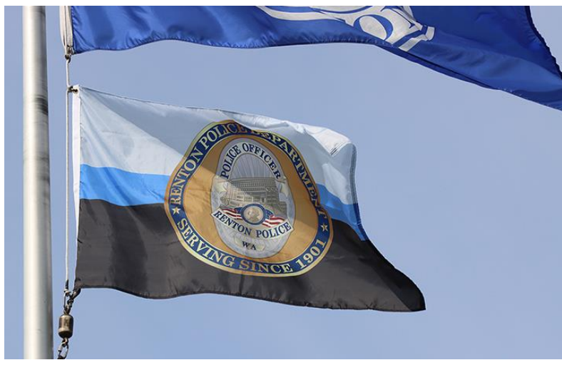
Renton Police Department's flag flies proudly over City Hall during Police Week 2020.

Google Translation available on website. For additional translation services contact communications@rentonwa.gov .