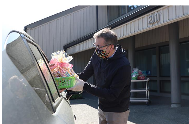
When COVID-19 forced the Renton Senior Activity Center's closure, community services staff immediately pivoted their outreach efforts. With additional funding from King County, they will be able to expand their outreach.

For those with a Puget Sound Business Journal account, the full story is online.