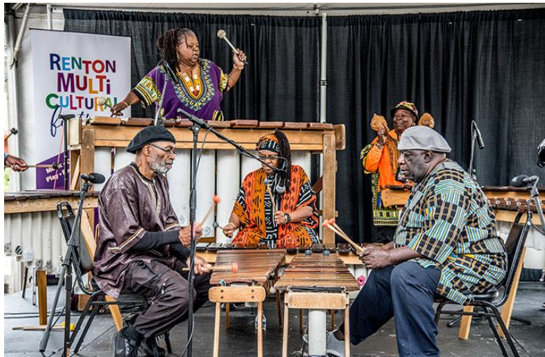
Events like the Renton Multicultural Festival receive part of their funding from lodging tax revenues.

The first will be Tuesday, Oct. 27, from 2 to 3 p.m. Topics include an explanation of the "Age-Friendly City" designation and the upcoming community-wide survey for seniors. Register to reserve your spot using course #9383. For help, call 425-430-6633.