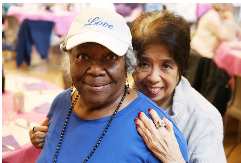
Renton joins Seattle as the only two cities in the state of Washington to earn "Age-Friendly" city status from AARP and WHO.

Google Translation is available on the website. For additional translation services contact communications@rentonwa.gov .