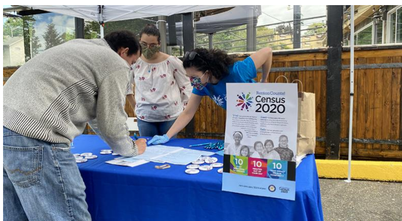
The city's census volunteers used community COVID-19 support efforts to help Renton residents complete their census forms.

Google Translation available on the website. For additional translation services contact communications@rentonwa.gov .