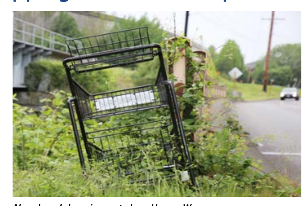
Abandoned shopping cart along Houser Way.

We instituted the original ordinance in 2016, because abandoned carts create a public nuisance. We've had tremendous cooperation