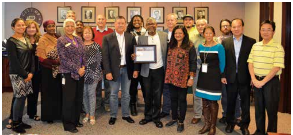
The Mayor's Inclusion Task Force

City employees have access to LanguageLine Solutions a telephone interpretation service that provides translation service for residents whose primary language is not English.