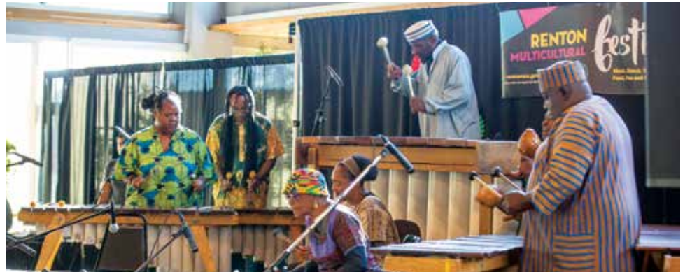
The Renton Multicultural Festival celebrates Renton's diversity through performances and informational exhibits. The 2018 festival will be held September 14 and 15.

Applications for jobs with the city will no longer require identifiable information, such as name or address. This eliminates implicit bias and allows the focus to be on the skills, qualifications, and experience of the applicant. Cover letters and resumes are submitted only if selected for an interview.